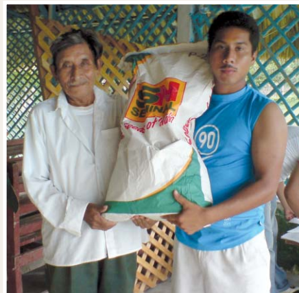
A relief volunteer gives a bag of seed to a local farmer.

■ These funds have been used to purchase nails, wood and wire to help reconstruct homes, and to provide seed for the new crop.