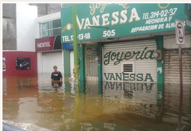
A local resident walks, waist deep, in flood water down a neighborhood street.

■ Benefactors were quick to mobilize funds and action: One helicopter pilot donated 50 hours of flying time in a cargo chopper. This resource was used to ferry medicines and other supplies and also to transport volunteers and relocate residents.